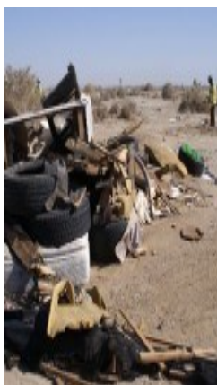
Example of Illegal Dumping site

The Antelope Valley Illegal Dumping Task Force Meets at 3 p.m. on The second Wednesday of every Month at: Fire Station No. 129 Training Center 42110 6th St. West Lancaster, CA