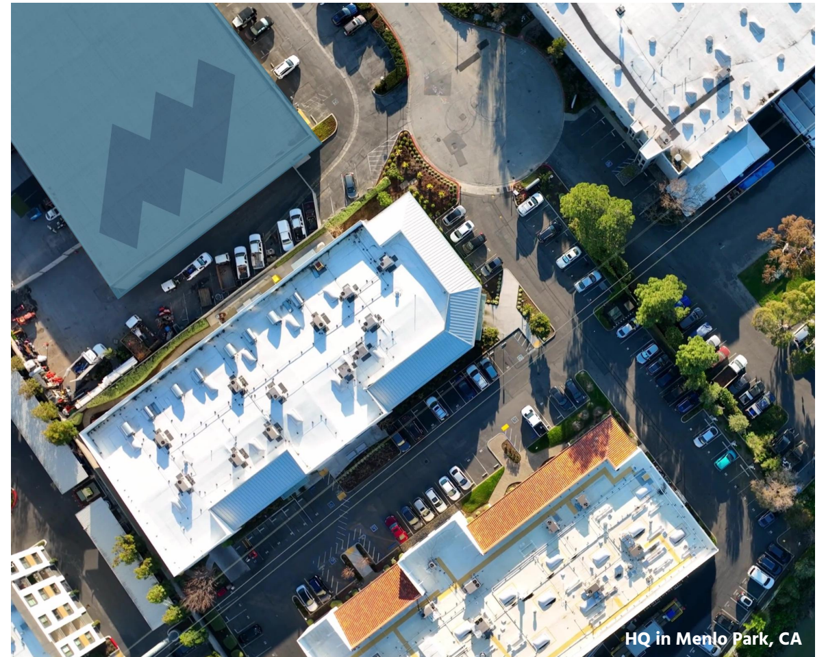
HQ in Menlo Park, CA

Investors include Khosla Ventures, Bill Gates, AEP, Lightrock, and NextEra