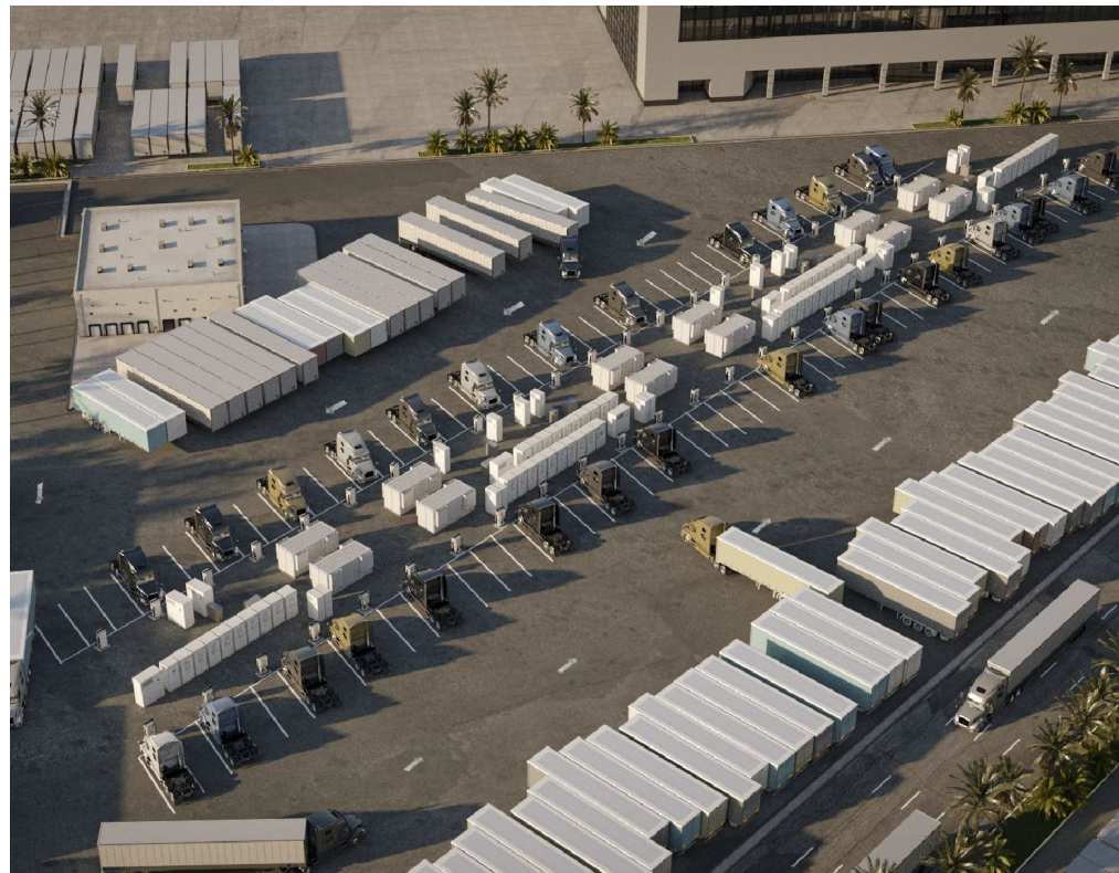
Rendering of 9 MW truck fleet EV charging microgrid

Clean, on-site EV charging infrastructure and prime power generation for a global leader in logistics real estate