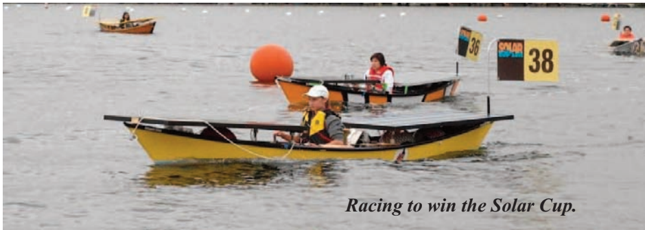
Racing to win the Solar Cup.

showcased the solar powered boat designed and built for the 9th Annual Solar Cup Race, to be held at Lake Skinner in Temecula Valley. The race, which featured 39 other Southern California high school teams, is designed to provide participants with an opportunity to learn about conservation, alternative energy, engineering, problem solving and team building.