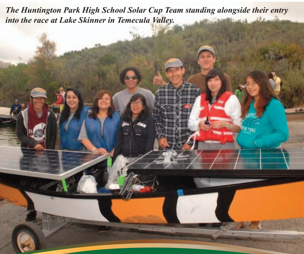
The Huntington Park High School Solar Cup Team standing alongside their entry into the race at Lake Skinner in Temecula Valley.