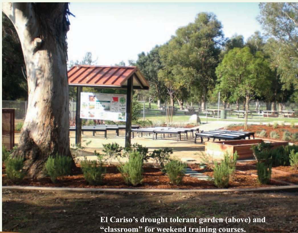
El Cariso's drought tolerant garden (above) and "classroom" for weekend training courses.