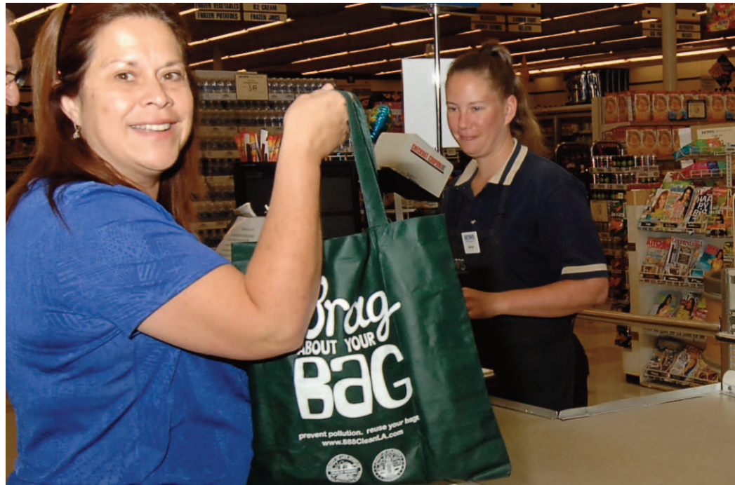
Area resident picking up free, reusable carryout bags at Hows Market in East Pasadena.

In the months leading up to the ban, teams from the County Public Works