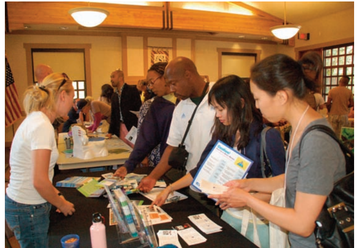
Teachers check out information on local environmental resources at Generation Earth's Summer Institute Workshop.

To learn more about Generation Earth Program, visit www.generationearth.com .