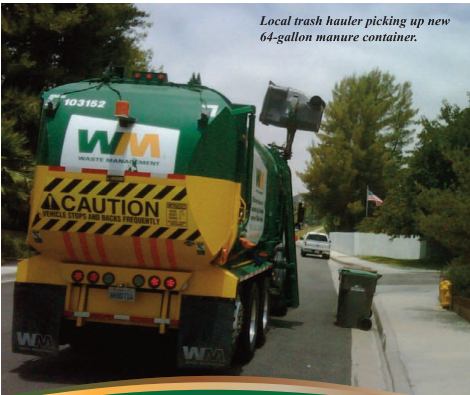
Local trash hauler picking up new 64-gallon manure container.