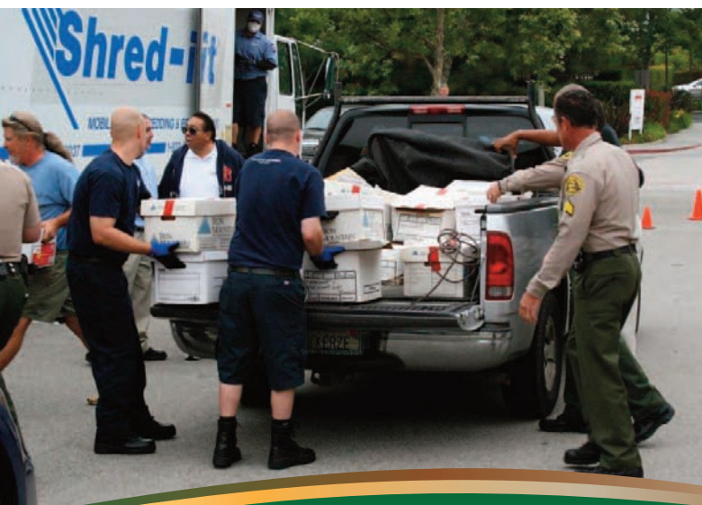
Calabasas area residents dropping off "shredable" documents.

sensitive documents that pose risks for identity theft. More than 80 vehicles passed through the event, dropping off nearly 13,000 pounds of old tax returns, medical records, bank statements and other sensitive documents. All paper tonnage was recycled and diverted from local landfills and will be reported to CalRecycle on the Cities 2011 Annual Solid Waste Report.