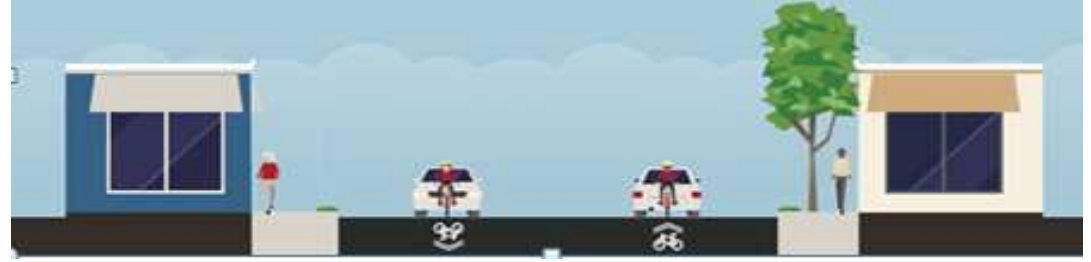
Residential Street with bike route.