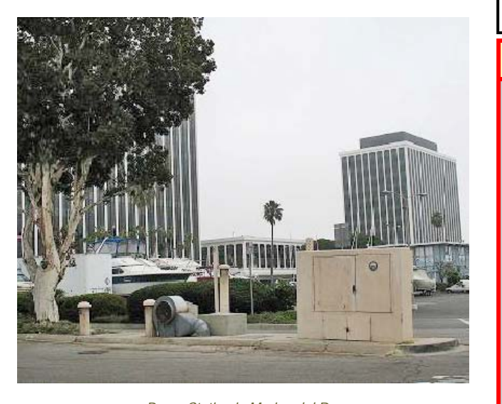
Pump Station in Marina del Rey