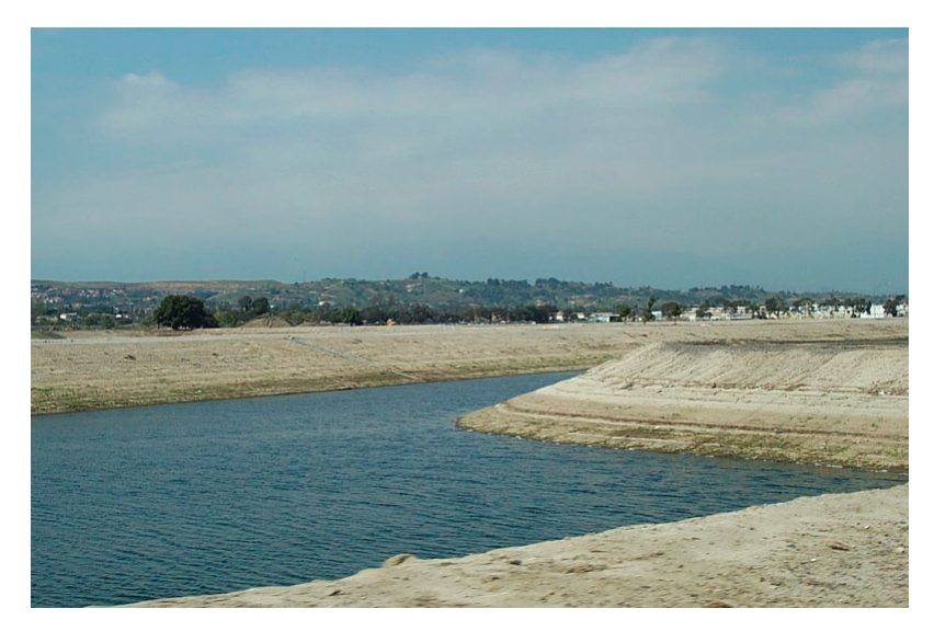
Figure 3-7. The Rio Hondo Spreading Grounds is one of the San Gabriel River's most productive recharge facilities.