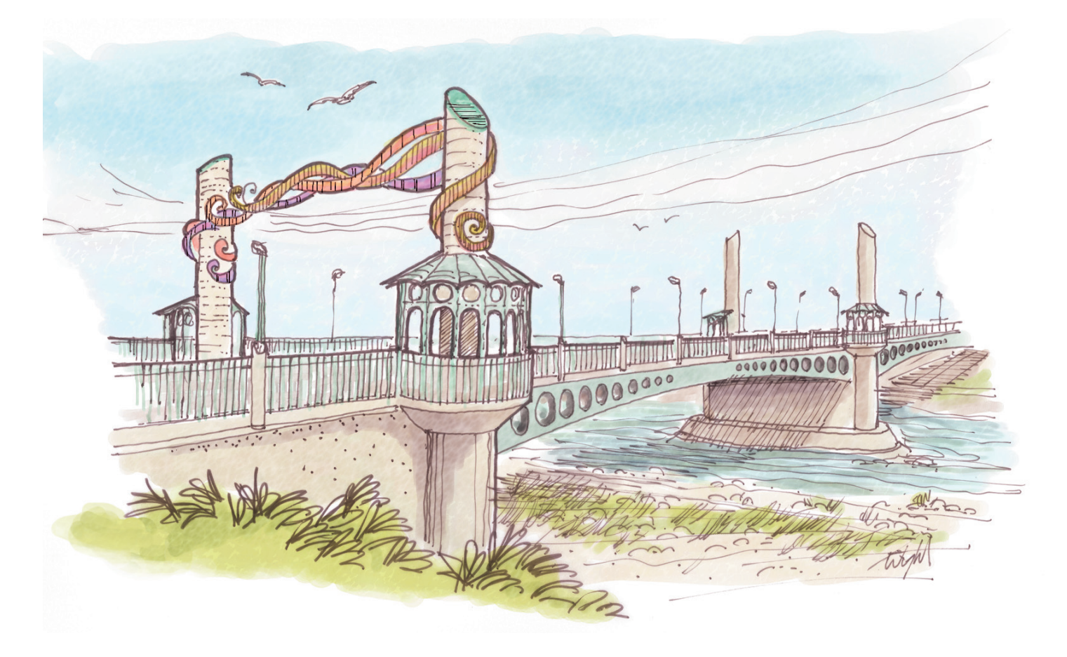
Figure 3-12. Gateways and bridges signal a river entrance.