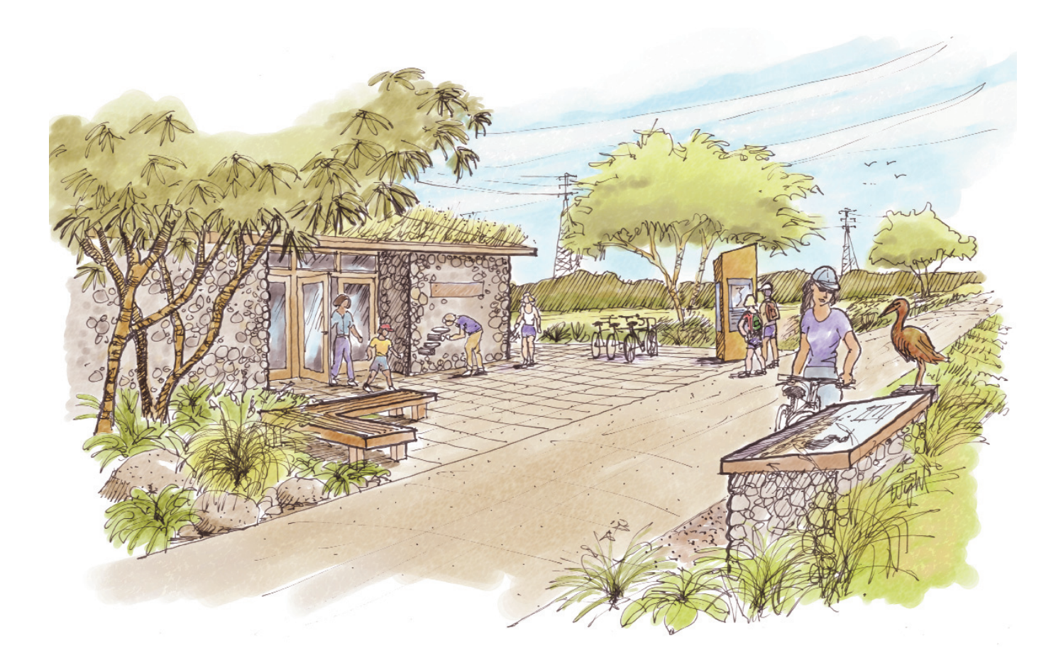
Figure 3-11. Educational Centers will draw school groups and visitors.

the San Gabriel River with easily accessible opportunities to enjoy the pleasures of a more natural, varied landscape. New and improved recreational and park facilities along the river carefully balance active recreational uses such as sports fields and playgrounds, with more passive uses that are habitat-friendly. Additional recreation is critically needed for many of the communities along the river corridor. Recreational programming ensures that these uses remain compatible with other functions of the river and builds a larger constituency of groups and individuals who are aware of the importance of the river in their community. (See Figure 3-13.)