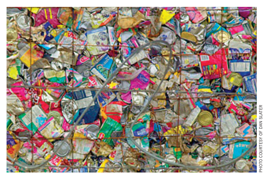
Figure 3-8. Trash is a serious problem in the river.

Residents of the San Gabriel Valley receive water supplies from local rainfall, reclaimed sources, and imported sources (from Northern and Eastern California and from Colorado). Every drop of water flowing in the San Gabriel River is appropriated to a water rights holder. Surface water rights are owned by two entities: the San Gabriel River Water Committee and the San Gabriel Valley Protective Association. The water is then distributed for direct use, or in the case of the Protective Association, it is used to recharge the underground aquifer on behalf of water producers in the San Gabriel River system. The San Gabriel River Watermaster manages groundwater resources in the Main San Gabriel Basin, including administering all adjudicated water rights. The Central Basin Watermaster and West Coast Basin Watermaster have the same roles for those groundwater basins located to the south. Water rights also establish the relationship between surface and groundwater flow from the upper portion of the river above Whittier Narrows to the lower portion of the river, ensuring that the Central and West Coast Basins receive their entitled share of waters within the supply system of the San Gabriel River Watershed.