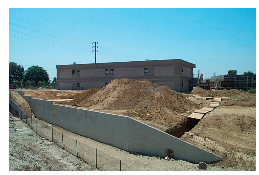
Figure 3-9. New businesses along the river can capitalize on proximity to the river through the application of quality design and development standards.

(See Table, Economic Development Element (ED), below)