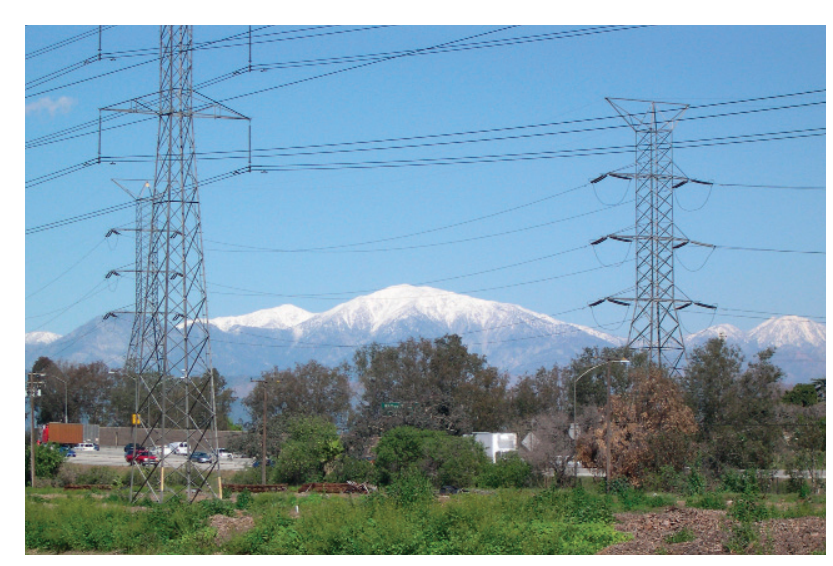
Figure 3-5. Utility easements, such as this one at the Woodland Duck Farm, offer open space area enhancement opportunities.