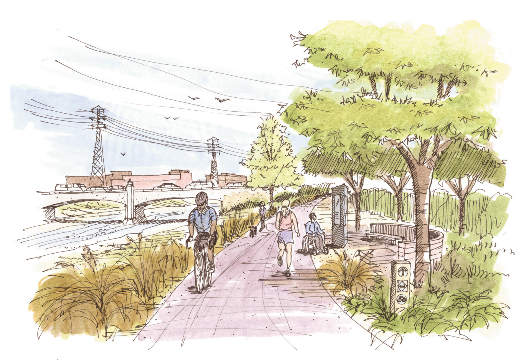
Figure 3-10. Trail enhancements help create an identity for the river.