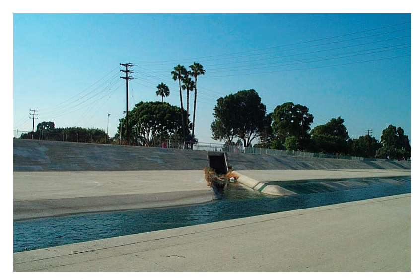
Figure 3-6. The low-flow channel moves water during the dry season.

(See Table, Flood Protection Element (FP), below)