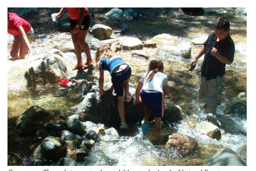
Figure 3-4. The cool river water draws children to the Angeles National Forest.