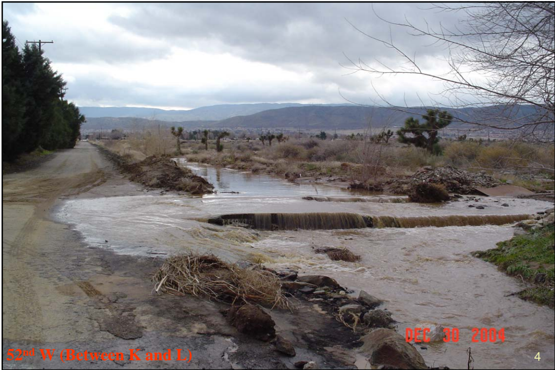
52 nd W (Between K and L)