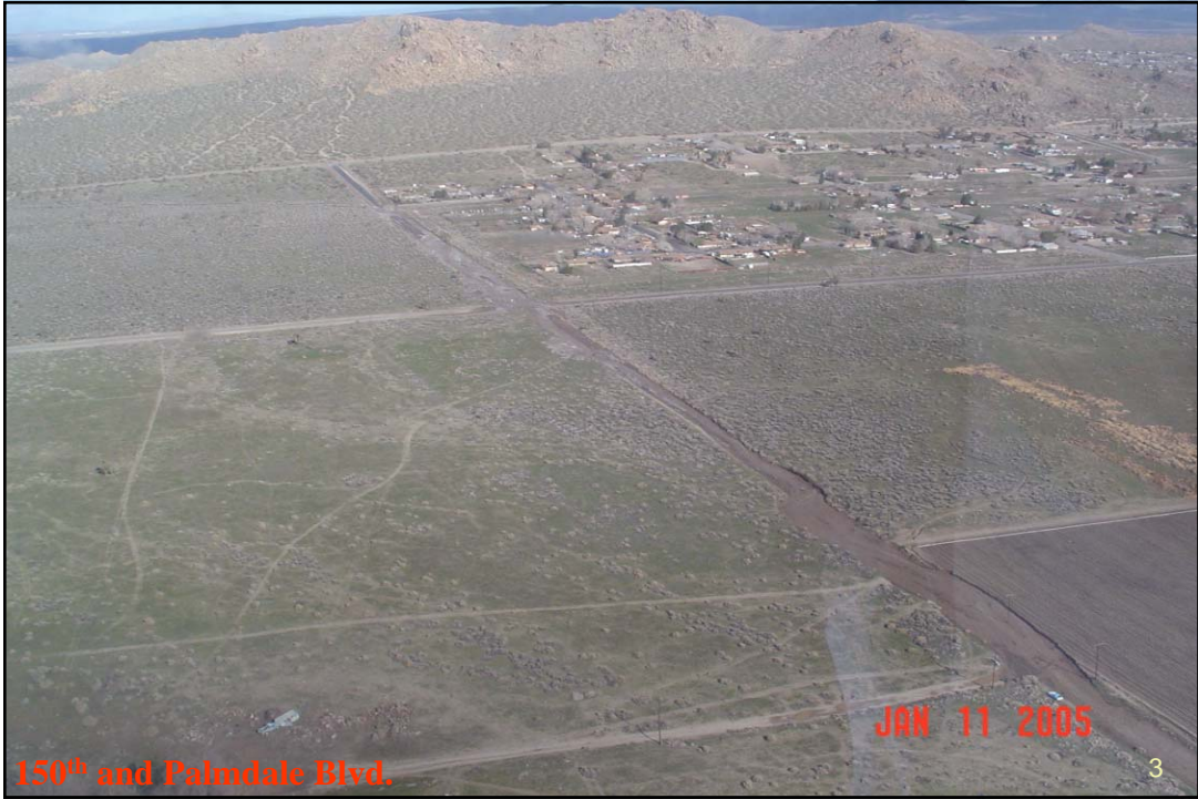
150 th and Palmdale Blvd.