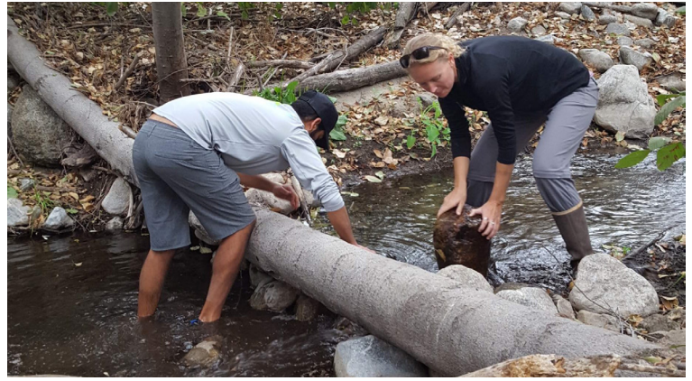
Biologists removing an illegally constructed rock dam.

lead to decreased populations. Swimming or bathing in the creek also introduces pollutants into the water. Use of bathing products such as shampoos and soaps can change the chemistry and quality of the water, and harmful bacteria and pathogens can be transmitted from people and animals to native aquatic species. Dams observed within the creek should be reported to Public Works so they can be carefully removed.