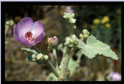
Davidson's bushmallow ( Malacothamnus davidsonii )

Davidson's bushmallow ( Malacothamnus davidsonii ) and southern black walnut ( Juglans californica ) are both rare plants that can be found growing in the Big T Mitigation area. Davidson's bushmallow is a shrub in the hibiscus family with