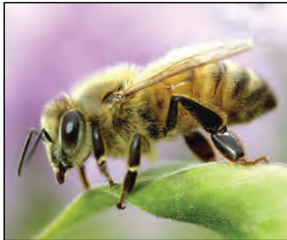
Honey Bee: Photo copyright: http://bbe-tech.com/bees/bee-identification/

Several ECORP employees and a maintenance crew member had recent and uncomfortable encounters with yellow jackets and honey bees at Big T. In both cases, non-native plants were being pulled or cut in the vicinity of nest and a hive and the bees went on the attack! Yellow jackets typically nest on the ground in rodent burrows or in hollow tree cavities and honey bees typically build their hives in tree cavities. Both species, but especially yellow jackets, can be highly defensive and troublesome when their nests, hives, or food sources are disturbed. While a bee can typically sting you only once, a yellow jacket can sting multiple times making them much more painful to contend with. Yellow