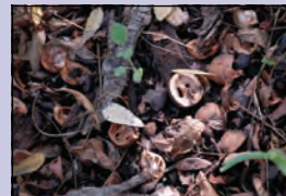
Above and Right: Southern Black Walnut ( Juglans californica )