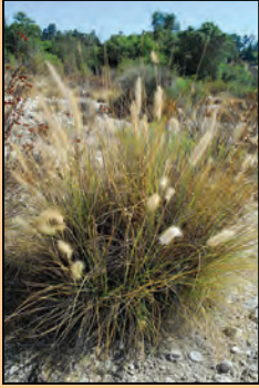
Non-Native African Fountain Grass

ECORP biologists and a work crew from Nature's Image spent seven days during September removing invasive, non-native plants from the Big T mitigation area. Invasive plants, when left unchecked, can potentially overtake an area while providing little or no benefit to native wildlife species that rely on native plants for food, shelter, and habitat. Arundo ( Arundo donax ), tree of heaven ( Ailanthus altissima ), and tamarisk ( Tamarix ramosissima ) were among the culprits targeted by the removal effort and are on the State of California's list of noxious weeds. Weeds were removed by hand-pulling, herbicide spraying, or a combination of cutting and spraying the stumps with herbicide. Large patches of arundo were removed along Haines Canyon Creek and in Big Tujunga Wash. Tree of heaven was also removed from areas along Haines Canyon Creek. Most of these were young trees ranging from a few inches to around eight feet in height. Tamarisk was removed from along Big Tujunga Wash. A large population of African fountain grass