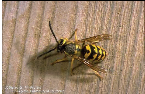
UC State-wide IPM Project © 2000 Regents, University of California