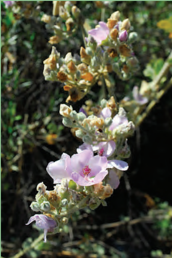
Davidson's bushmallow ( Malacothamnus davidsonii ).