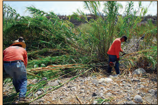
Nature's Image removing non-native Arundo.