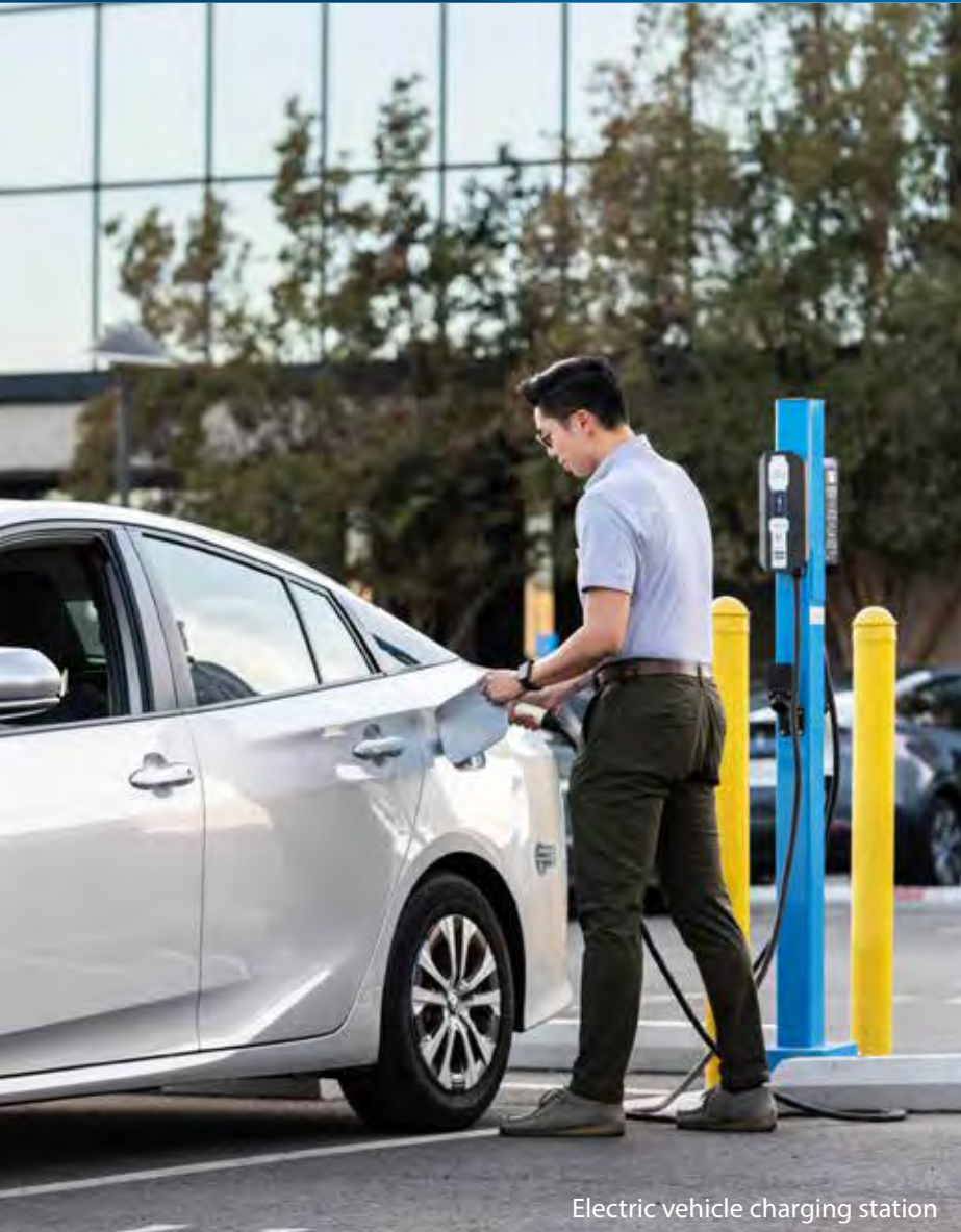
Electric vehicle charging station

The Environmental Services CSA provides solid waste management services, sewer maintenance, and environmental services to our unincorporated communities, contract cities, and the Los Angeles County region. The Environmental Services CSA also supports Public Works' workforce by maintaining a sustainable fleet, protecting employees' health and safety, and reducing risk where possible. The Environmental Services CSA manages solid waste infrastructure consisting of residential waste collection franchises, garbage disposal districts, and a commercial franchise system; manages, operates, and maintains sewer infrastructure within the Consolidated Sewer Maintenance District and the Marina Sewer Maintenance District comprised of sewer lines, sewage pumps, and wastewater control treatment plants; and is also responsible for Public Works' fleet, which includes on- and off-road vehicles and equipment. The Environmental Services CSA Business Plan establishes various strategies centered around equity, resiliency, and sustainability to pursue a waste-free future, optimized sewer infrastructure, and a carbon neutral fleet that will improve the environmental wellbeing of our communities.