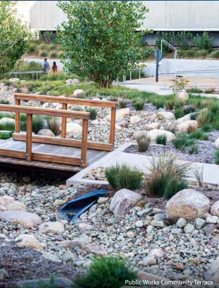
Public Works Community Terrace

Public Contracting and Asset Management (PCAM) provides highly skilled technical services to Public Works' Business Areas through modern infrastructure design, equitable contracting opportunities, and efficient asset management.