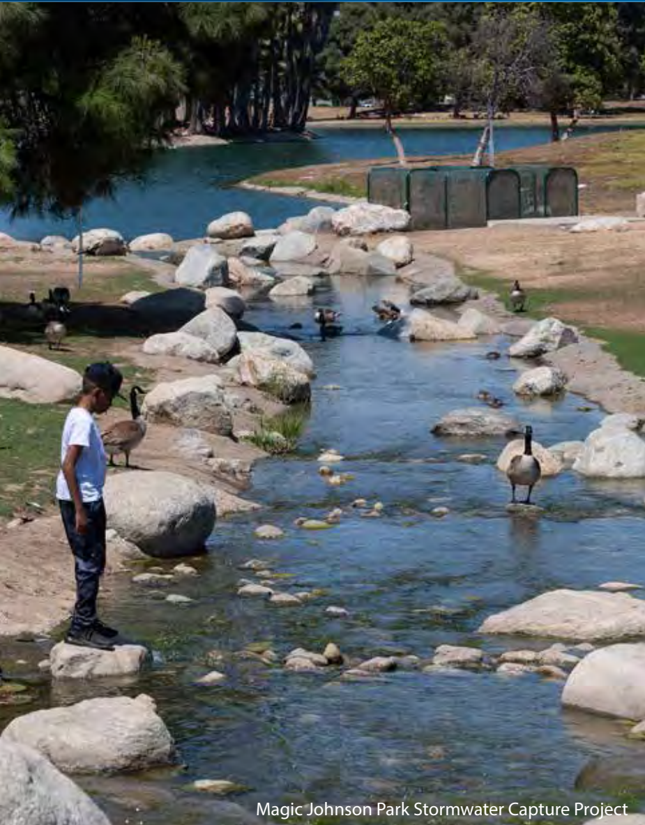
Magic Johnson Park Stormwater Capture Project

The Water Resources Core Service Area (CSA) is responsible for managing stormwater, providing potable water, and ensuring healthy watersheds for the safety and benefit of Los Angeles County communities. It plans, operates, and maintains infrastructure within the Los Angeles County Flood Control and Waterworks Districts through implementation of integrated water resource strategies. The Water Resources CSA Business Plan establishes various strategies to advance regional water resources management practices through the development of enhanced infrastructure, livable communities, and resilient and sustainable resources.