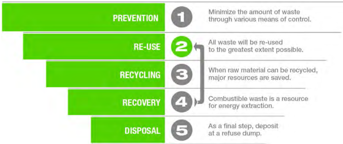
Figure 2. The waste management hierarchy of the EU, which is also endorsed by the EPA.