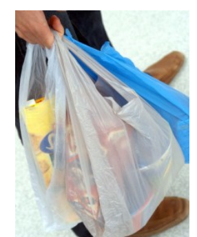
Starting Tuesday, the ban on plastic bags ensue in the city of Los Angeles.

Paper bags will still be available at these stores, but cost 10 cents each.