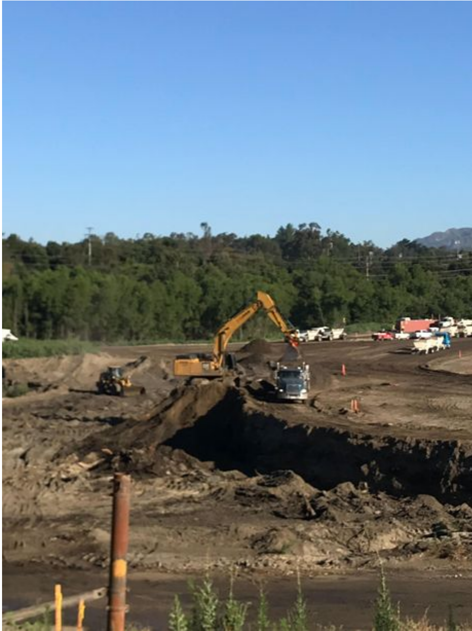
Log Entry Photo C