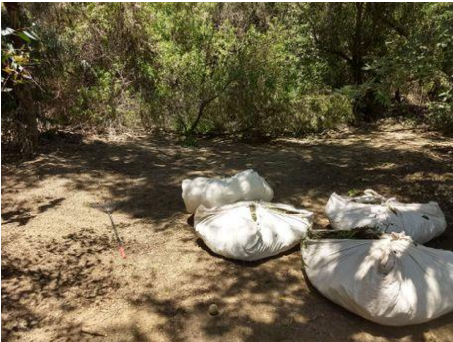
Log Entry Photo C