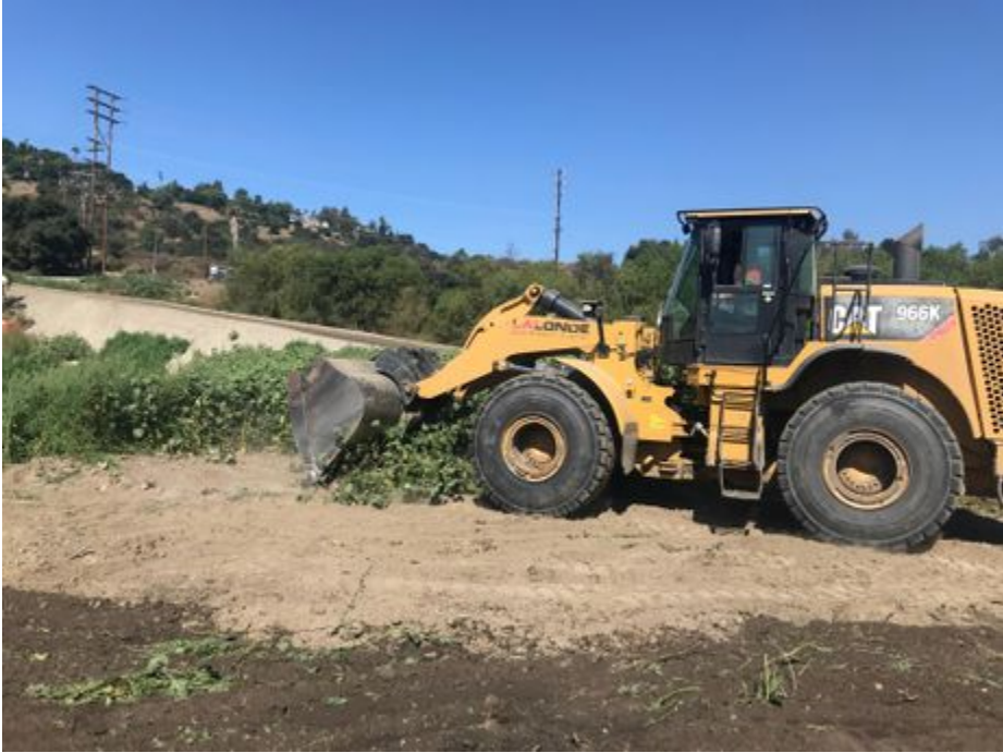
Log Entry Photo C