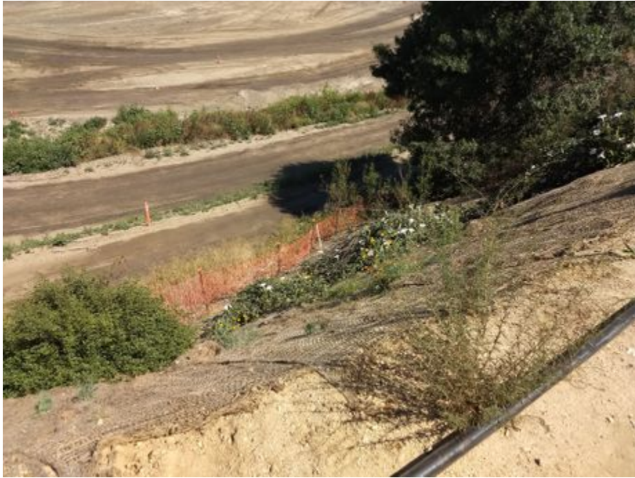
Log Entry Photo B