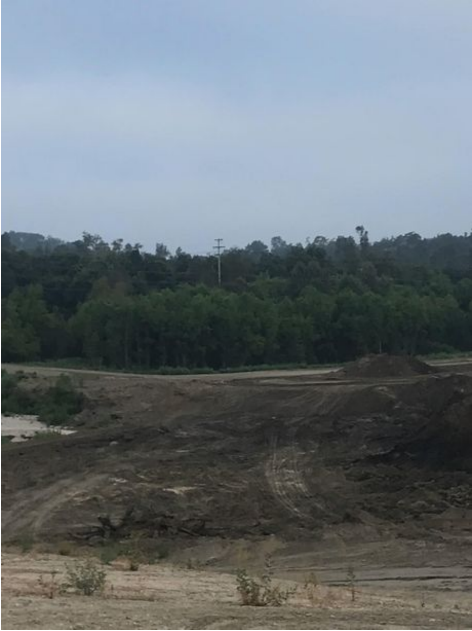
Log Entry Photo B