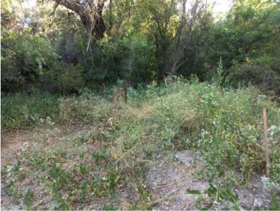
Log Entry Photo B