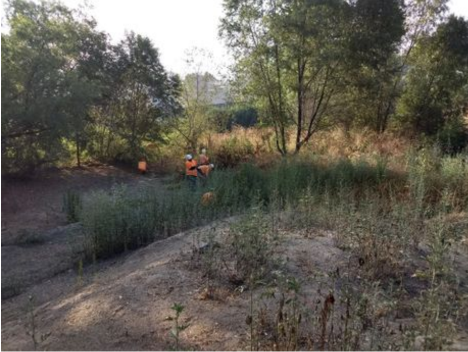
Log Entry Photo B