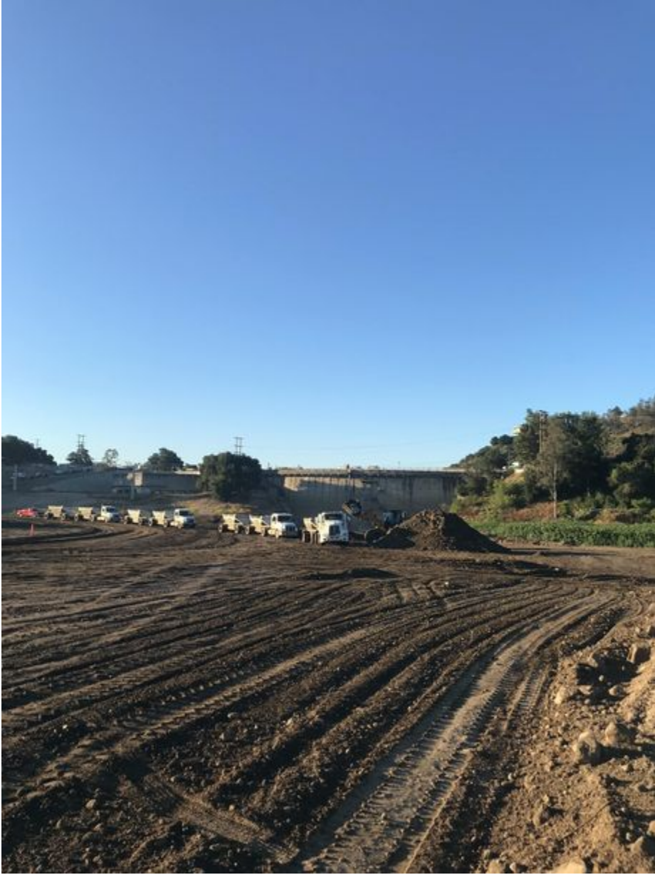
Log Entry Photo C