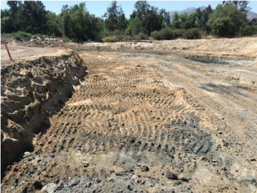
Log Entry Photo D