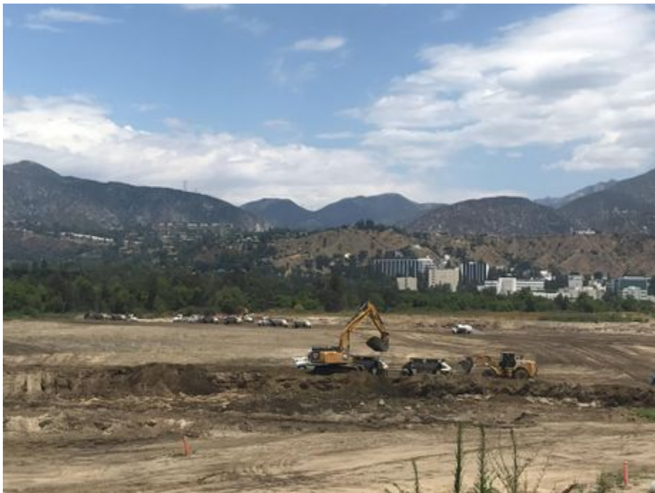
Log Entry Photo C