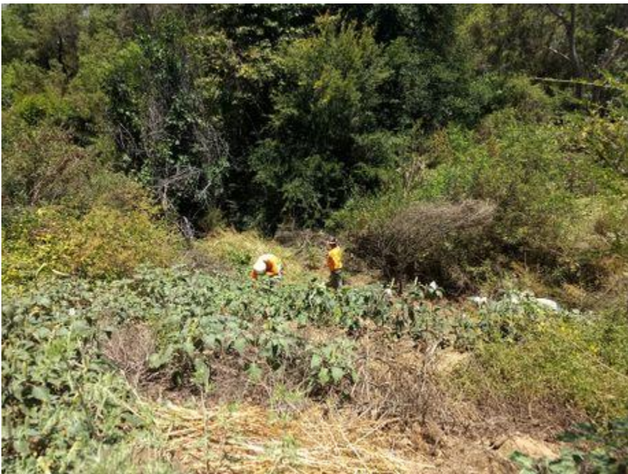
Log Entry Photo C