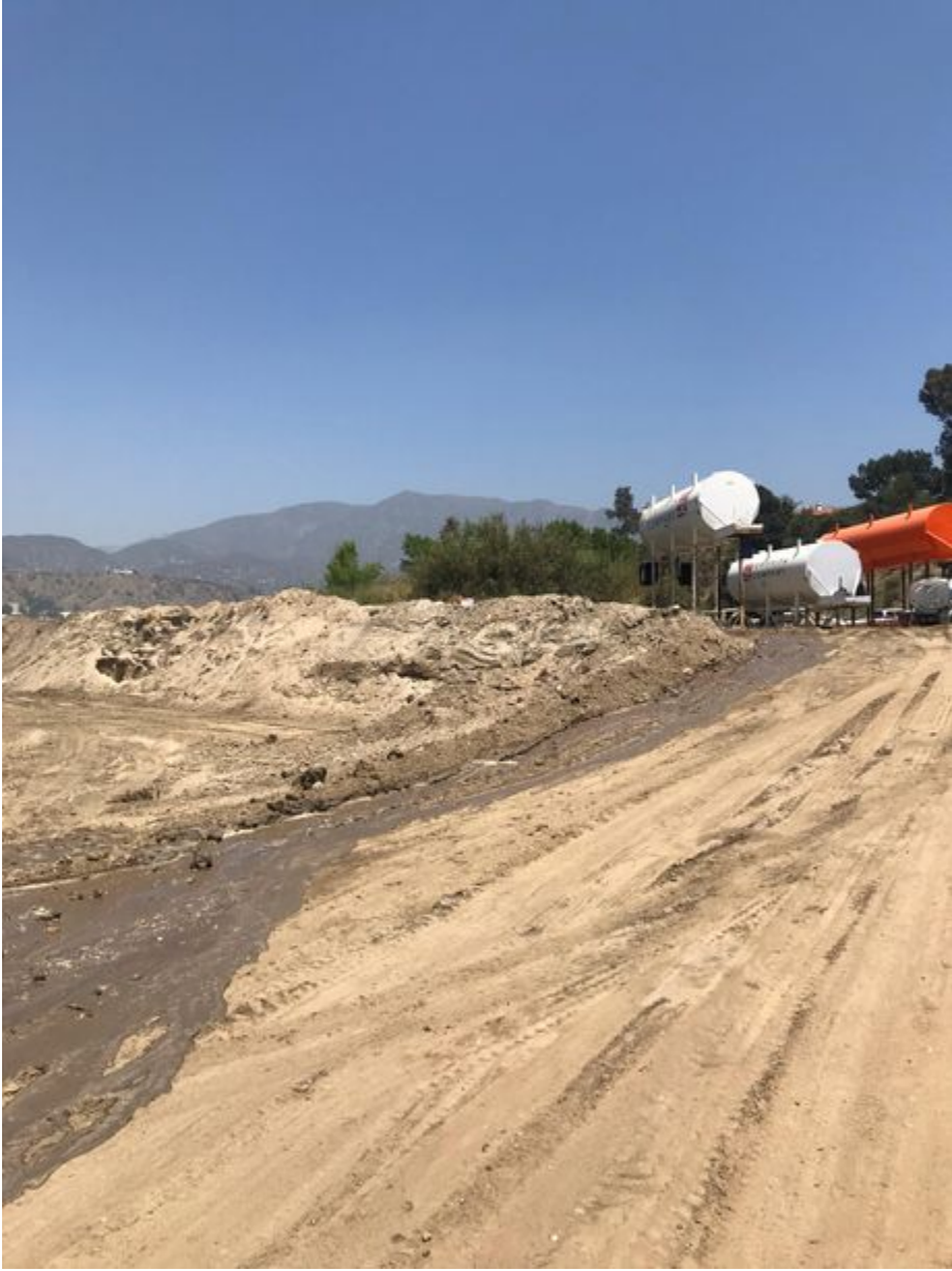
Log Entry Photo D