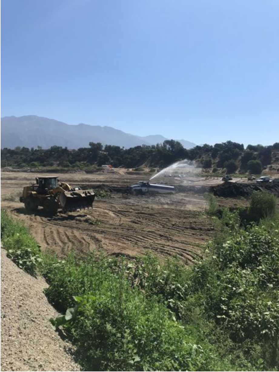
Log Entry Photo D