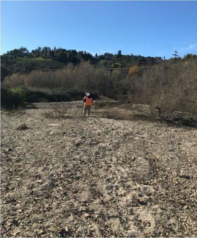
Log Entry Photo C