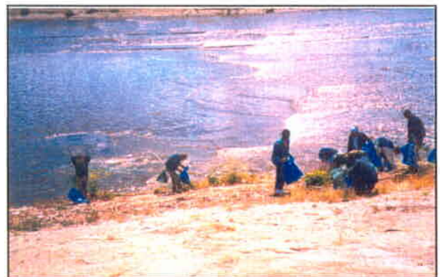
Cleaning along the River.