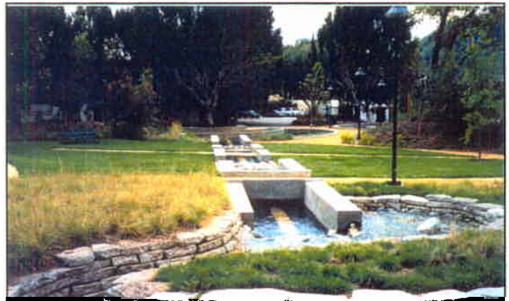
River Garden Park's simulation of the River.

Conservation Authority, a joint powers authority, lead the construction of River Garden Park with state and local park funds. Conveniently located at the Los Angeles River Center and Gardens, which has a river exhibit that offers a tour of the River's history and ecological attributes, the park features an artistic simulation of the Los Angeles River and it's native plant surroundings, as designed by landscape architect Calvin Abe. Water springs from a mosaic monument that depicts the River's headwaters, flows down a path with natural walls, and passes through an interpreted concrete channel. The park celebrates the River's life and surrounding communities.