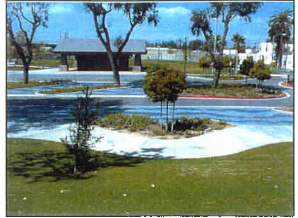
Cesar E. Chavez Park

Last fall on November 18, 2000, the City of Long Beach Parks, Recreation and Marine Department held an opening for the second phase of the development of the Cesar E. Chavez Park. The thirteen acre park is the first new park in Long Beach in over twenty years. The park features many amenities including picnic tables, basketball courts, park benches, and grassy play areas. The second phase of the park project involved the construction of a community center and further phases are proposed to provide a family aquatic center, an amphitheatre, a gymnasium, and a connection to the LARIO Bicycle Trail, which is part of the Master Plan. Until officially completed, the Cesar E. Chavez Park will continue to provide a recreational opportunity in one of the most densely populated low-income neighborhoods in downtown Long Beach.