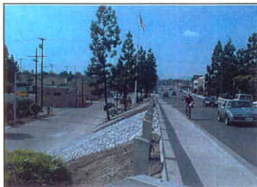
Gage Avenue, heading towards the River.

The City of Bell is undertaking an effort to assist in the revitalization of the River. The 2.8 square mile city, which has very little park and open space, has taken the opportunity to improve the River's access points. The improvements include landscaping with native plants, the installation of drip irrigation, and river rock features. Construction of the improvements for Gage and Florence Avenues was completed in November 2000