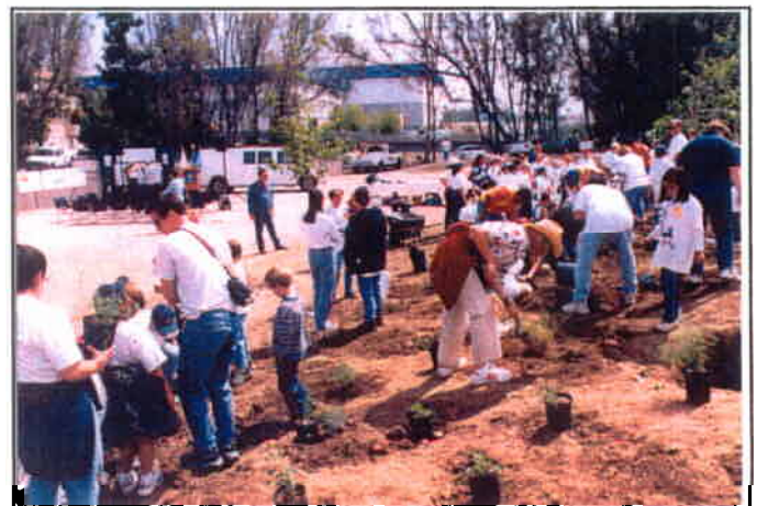
Volunteers begin planting one hundred shrubs and twelve trees.