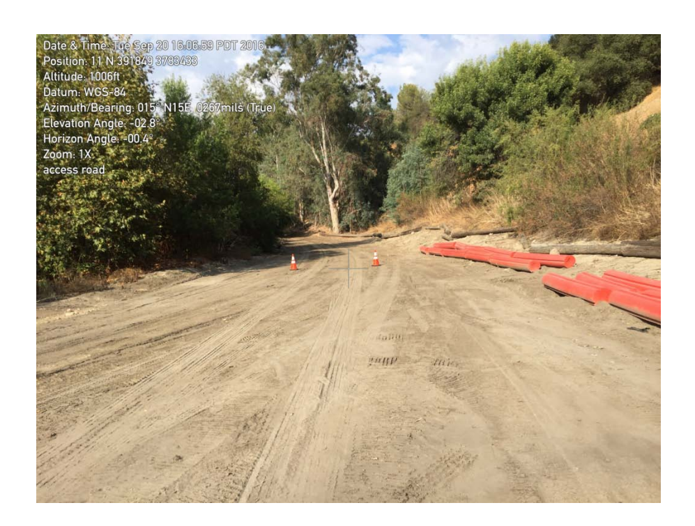
Photo 1. Cones blocking off access road for avoidance within 500 feet of where the least Bell's vireo was observed. Photo facing north.